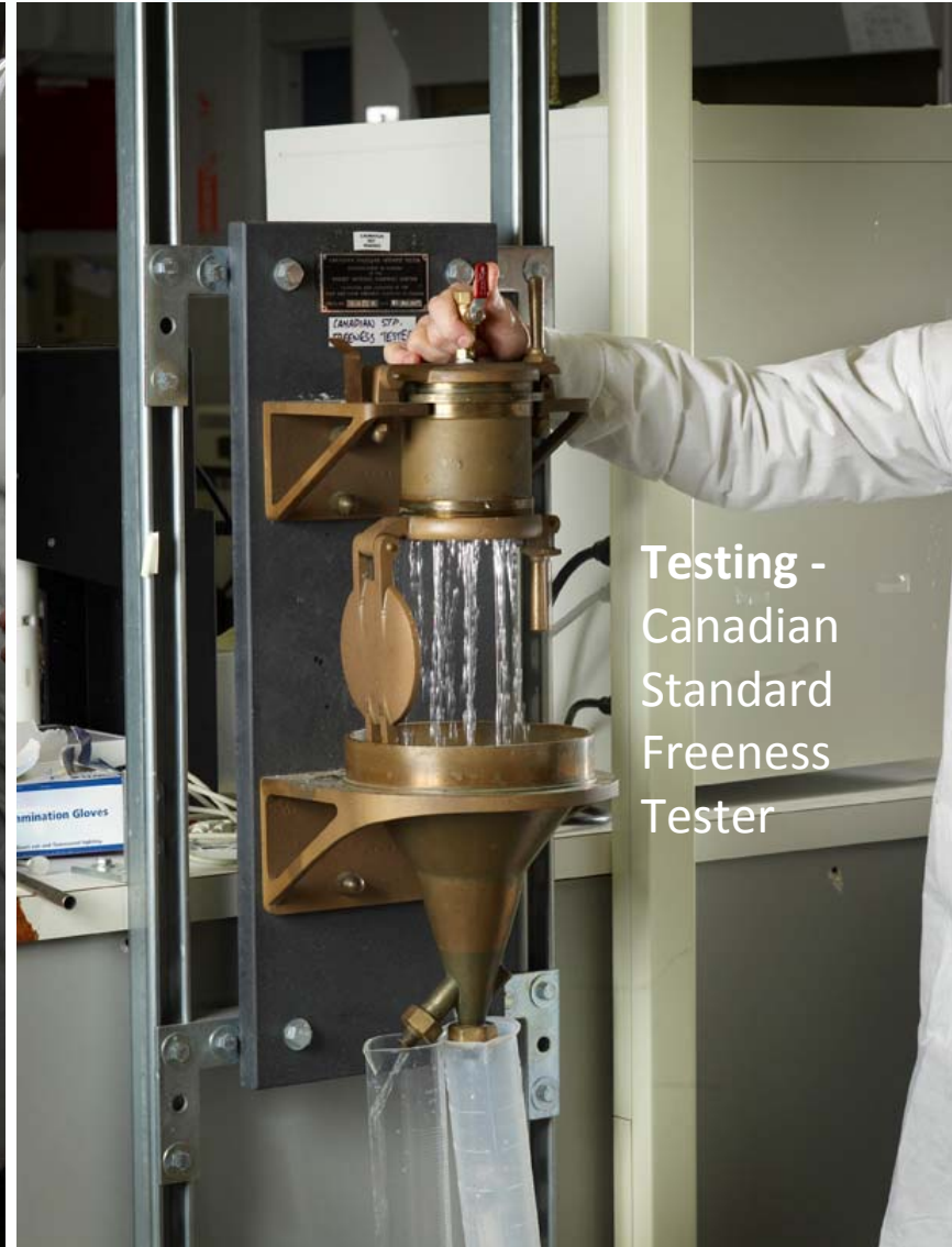
Testing - Canadian Standard Freeness Tester