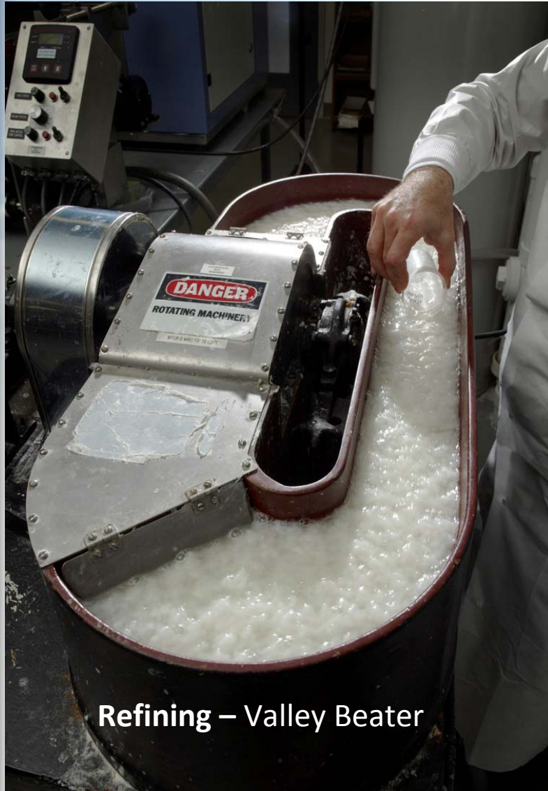
Refining – Valley Beater